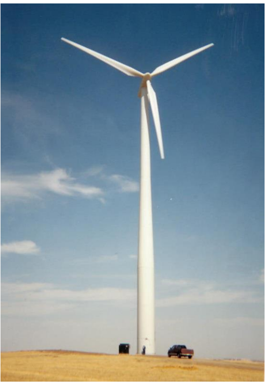
Horizontal Axis Wind Turbine (0.66 MW)