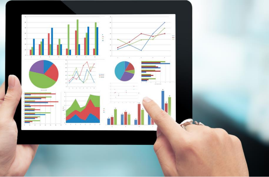
2023 SAMA Expense Categories